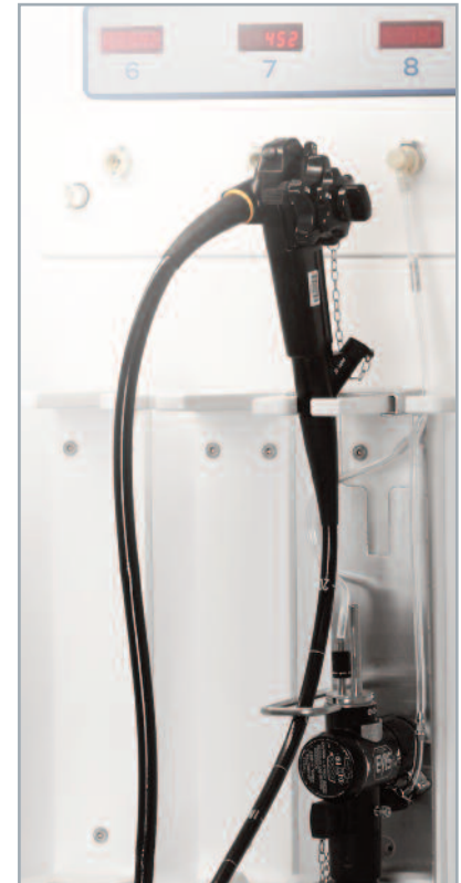
Ease of endoscope placement and one-click cabinet connection