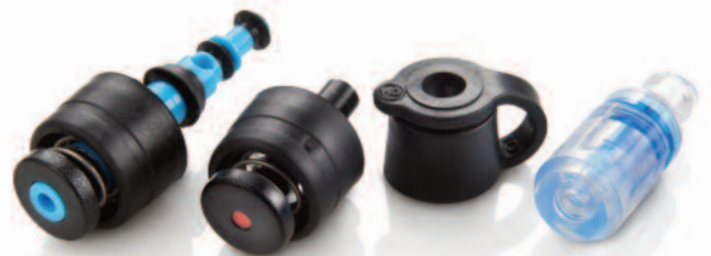
DEFENDO™ Single-use Valves for OLYMPUS Endoscopes