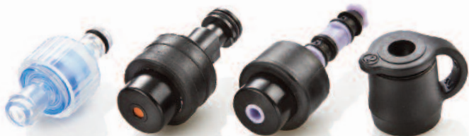
DEFENDO™ Single-use Valves for PENTAX Endoscopes

DEFENDO™ Single-use Valves are Fully Compatible With All Leading GI Endoscopes, Including Olympus® and the Pentax® 90 & i10 Series.